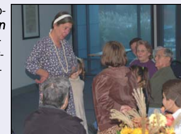
"Eleanor Roosevelt" from Warm Springs, GA.

The exhibition was created by the Franklin D. Roosevelt Presidential Library and Museum in Hyde Park, New York. The photographs are drawn from the massive Farm Security Administration collection of Depression-era photographs at the Library of Congress. These photographs include some of the most familiar and powerful