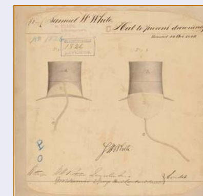
Patent for a Hat to Prevent Drowning, 1840 on display in the Public Vaults and Boeing Learning Center at the National Archives, Washington, D.C.