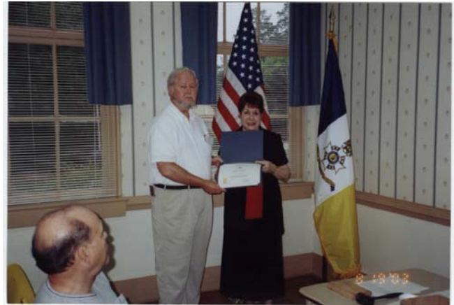
Carrollton chapter of the Sons of American Revolution presenting Arden with a thank-you "document" for speaking at their meeting.