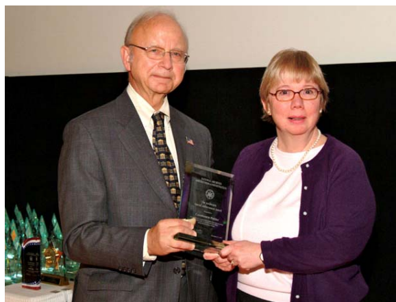
In 2007, she received the Archivist Award from then Archivist of the United States Allen Weinstein for educating and mentoring NARA staff, volunteers, and the public about family history records.

She will also talk about series on microfilm and online and the differences in both approaches.