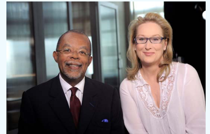
Faces of America will air on Georgia Public Broadcasting for four weeks beginning February 10, 2010. Above are Henry Louis Gates, Jr. with actress Meryl Streep.